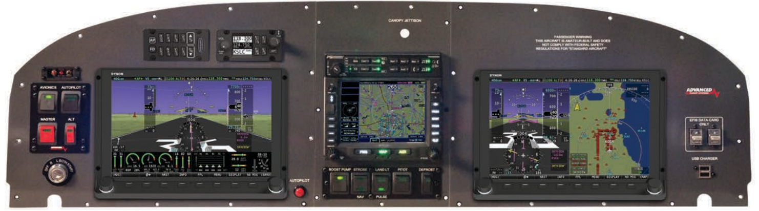
SkyView HDX Equipped IFR ADVANCEDPANEL