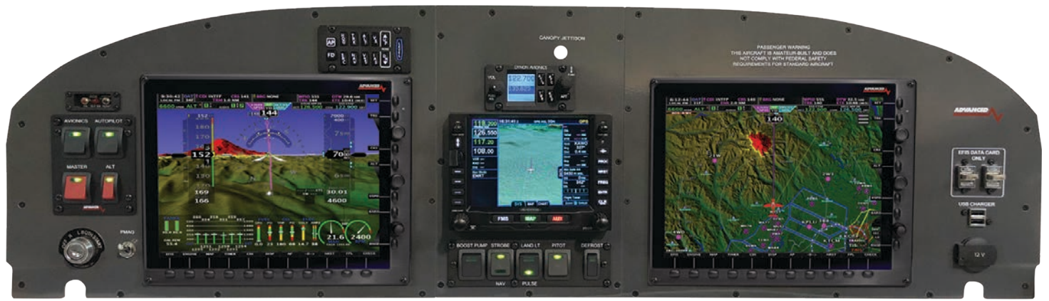
AF-6600 HDX Equipped IFR ADVANCEDPANEL

The builder who wants a complete, custom panel, tailored to their aircraft and mission, fully configured, ready to install.