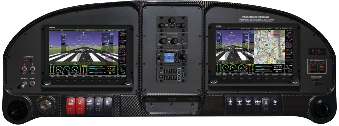
SkyView HDX Equipped VFR Aerosport ADVANCEDPANEL